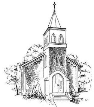
St. Stanislaus, Chatsworth Sunday 9:00 am